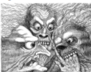
An artist's impression of the Three Witches.

The second time they were seen, once again late at night upon the heath, it is alleged, they were met by King Macbeth, who was not king at the time of the meeting. The King, of course, denies all knowledge of the meeting.