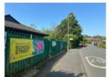
Sign outside the school promoting the upcoming School Street

The School Street will have a soft launch on Wednesday 4th September, where the new traffic measures will begin to be implemented, allowing parents and residents to adjust to the changes. The official complete launch is set for Monday 9th September, when the ANPR cameras will be fully operational. From this date, any parents or drivers who do not comply with the School Street restrictions will receive a warning letter. If they continue to ignore the rules after the warning, they will face a fine. This phased approach ensures everyone has time to adapt while reinforcing the importance of adhering to the new guidelines for the safety of the children.